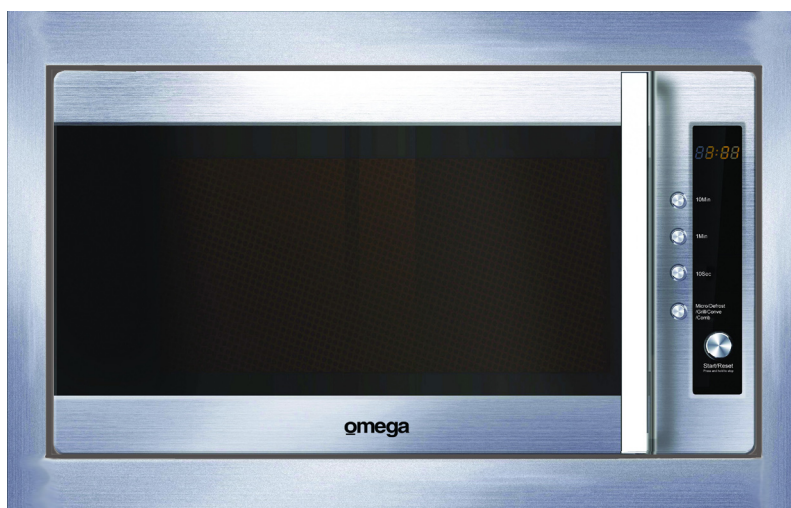
OM250CXA shown with OTK25X 60cm trimkit

trimkit dimensions: 376mmH x 598mmW x 21mmD internal dimensions: 287mmH x 518mmW x 21mmD